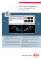
Leica Cyclone REGISTER