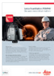
Leica ScanStation P30/40

Illustrations, descriptions and technical specifications are not binding. All rights reserved. Printed in Switzerland – Copyright Leica Geosystems AG, Heerbrugg, Switzerland 2015. 835466en - 03.15 - INT